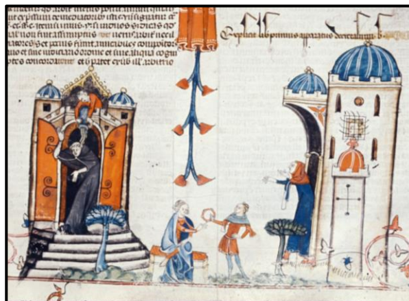
Marginalia in the Smithfield Decretals. London, British Library, MS Royal 10 E IV, fol. 91r.

Students are expected to attend all taught components of the programme.