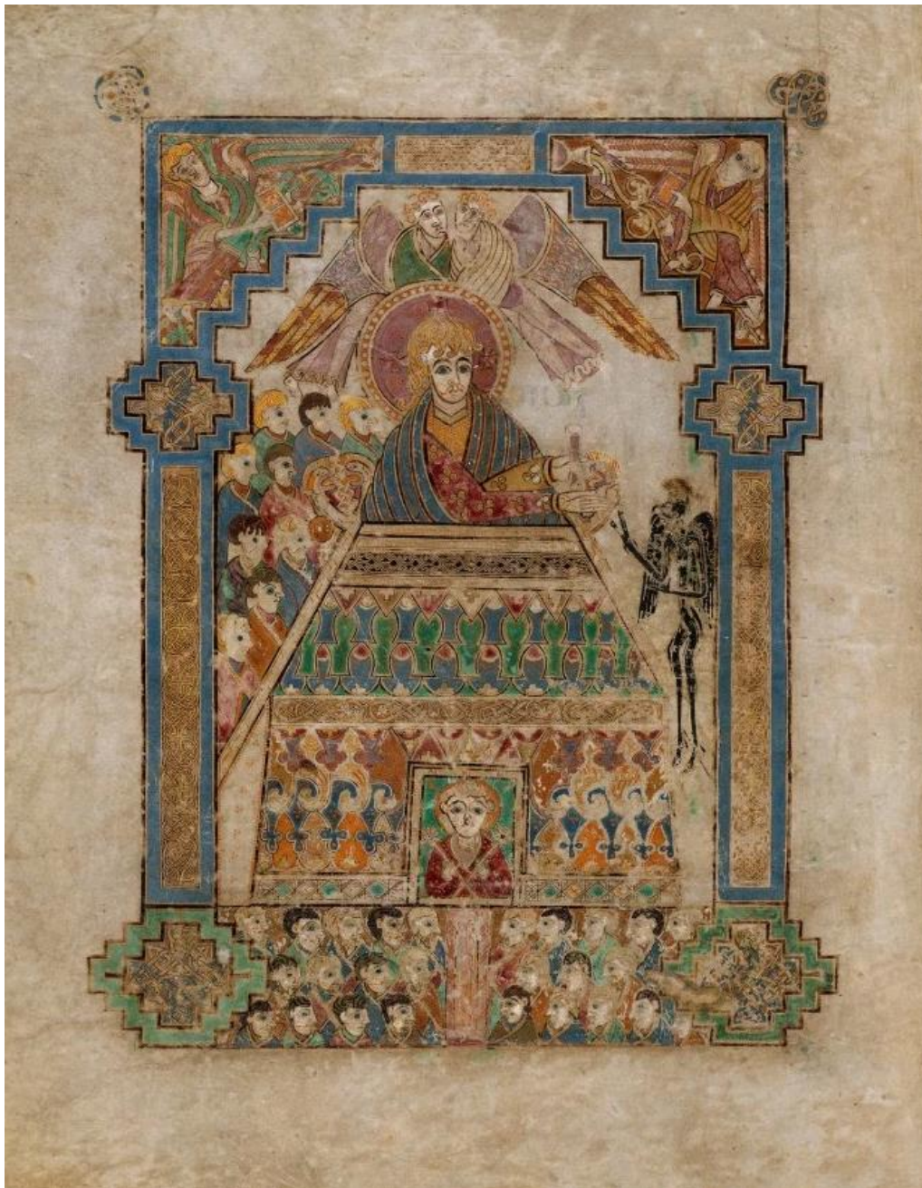
TCD MS 58, fol. 202v

Modern history of China and the global and regional networks that shaped the treaty ports, which were opened to foreign traders by force in the nineteenth and early twentieth centuries